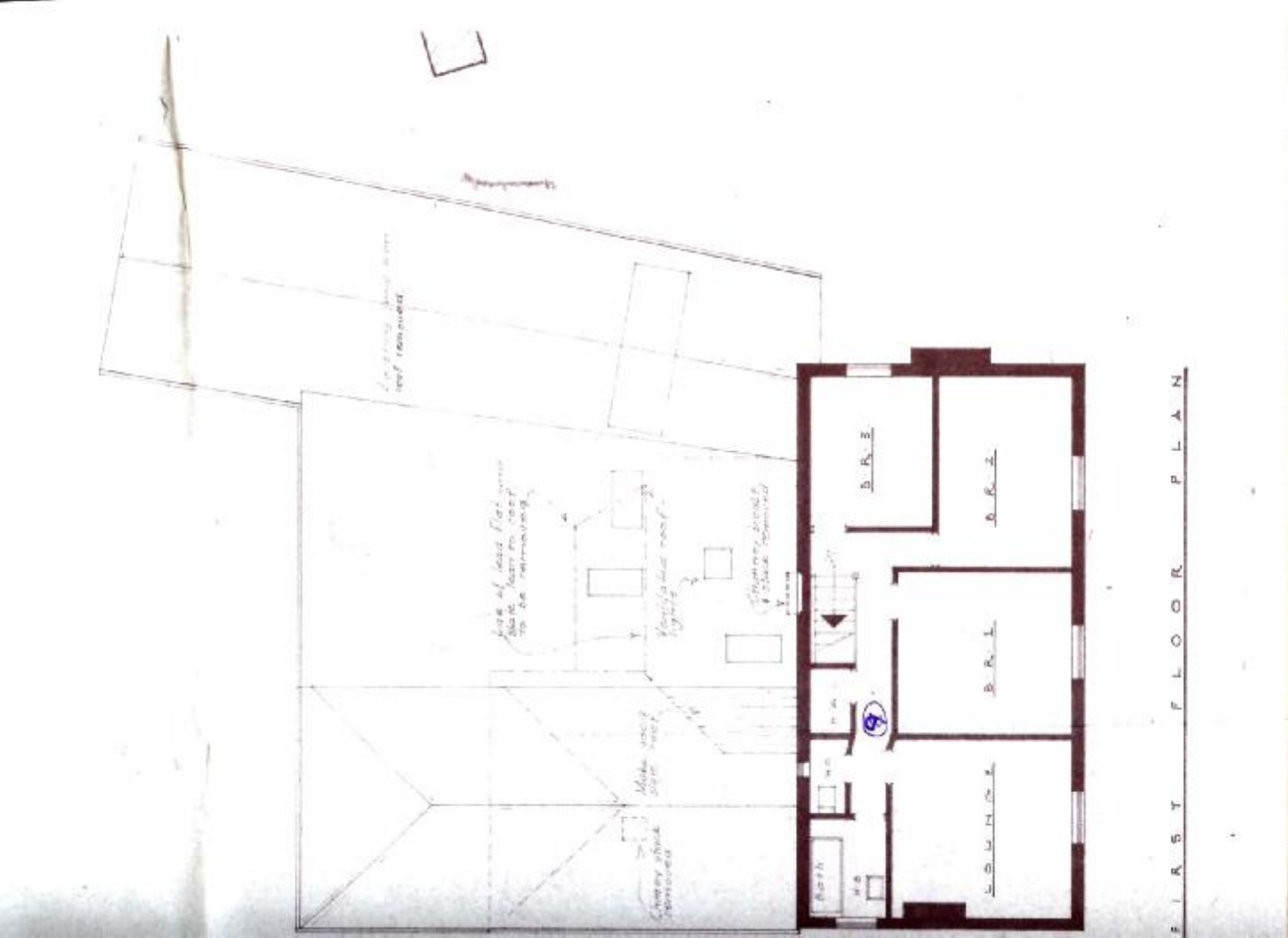
Description of Drawing: First floor layout.