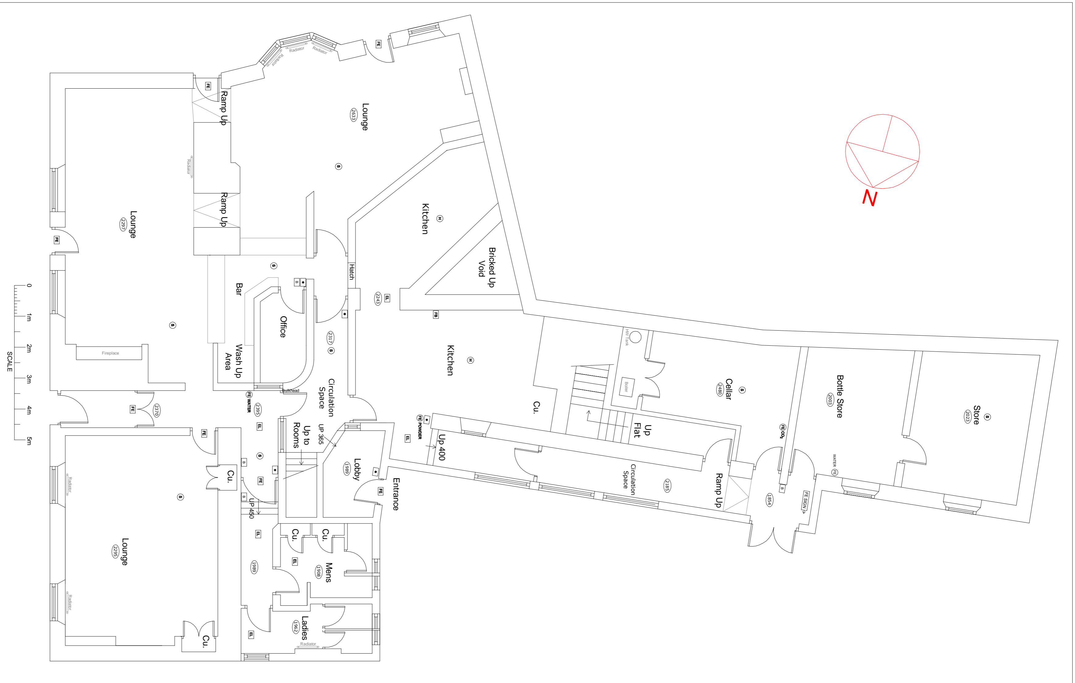
Plan of Ground Floor 1:75