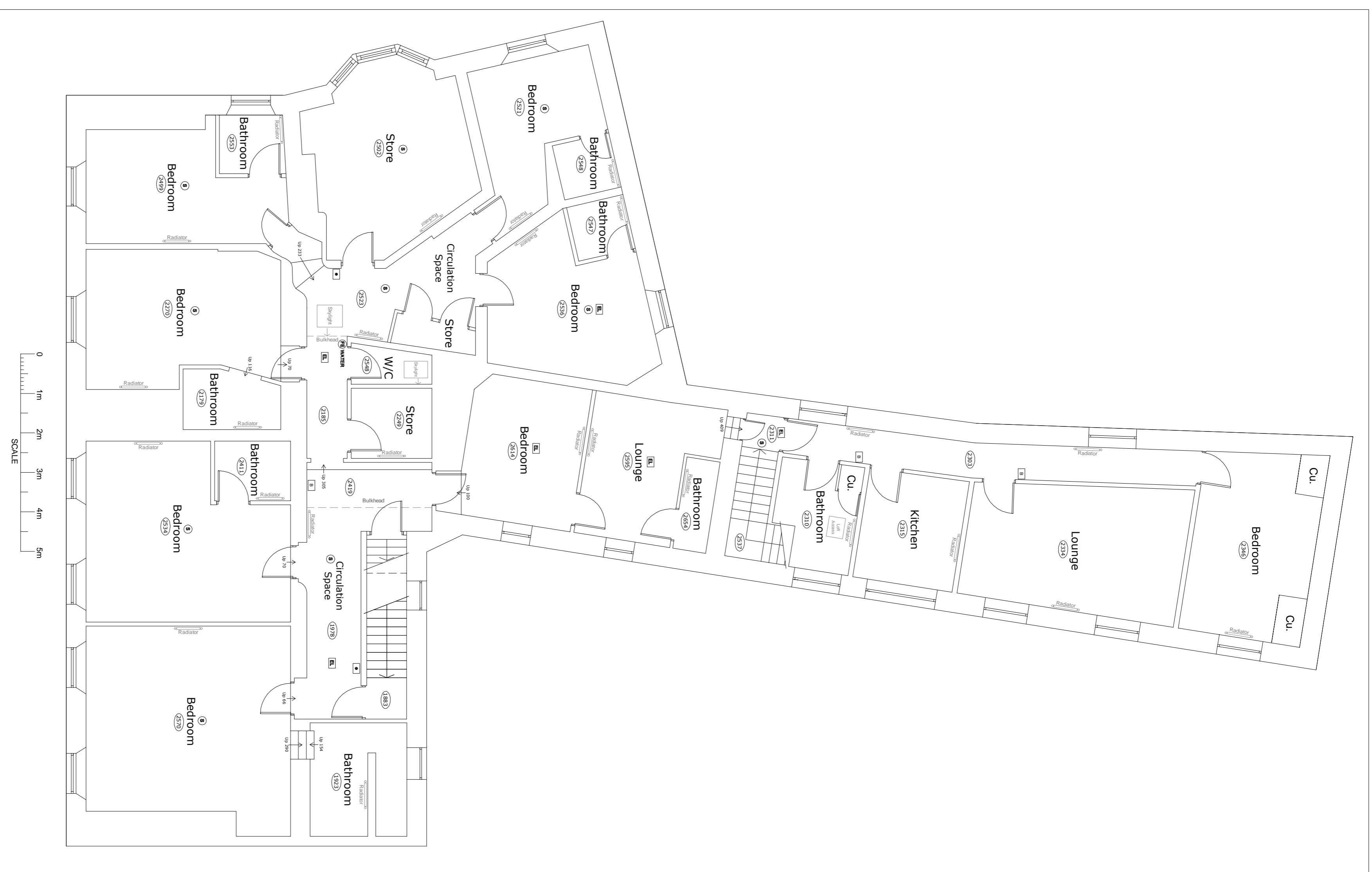
Plan of First Floor 1:75