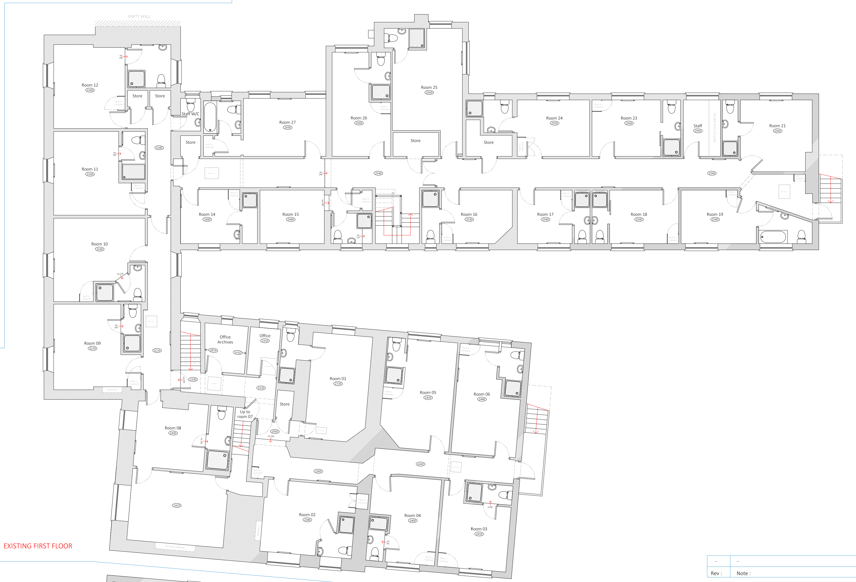
EXISTING FIRST FLOOR