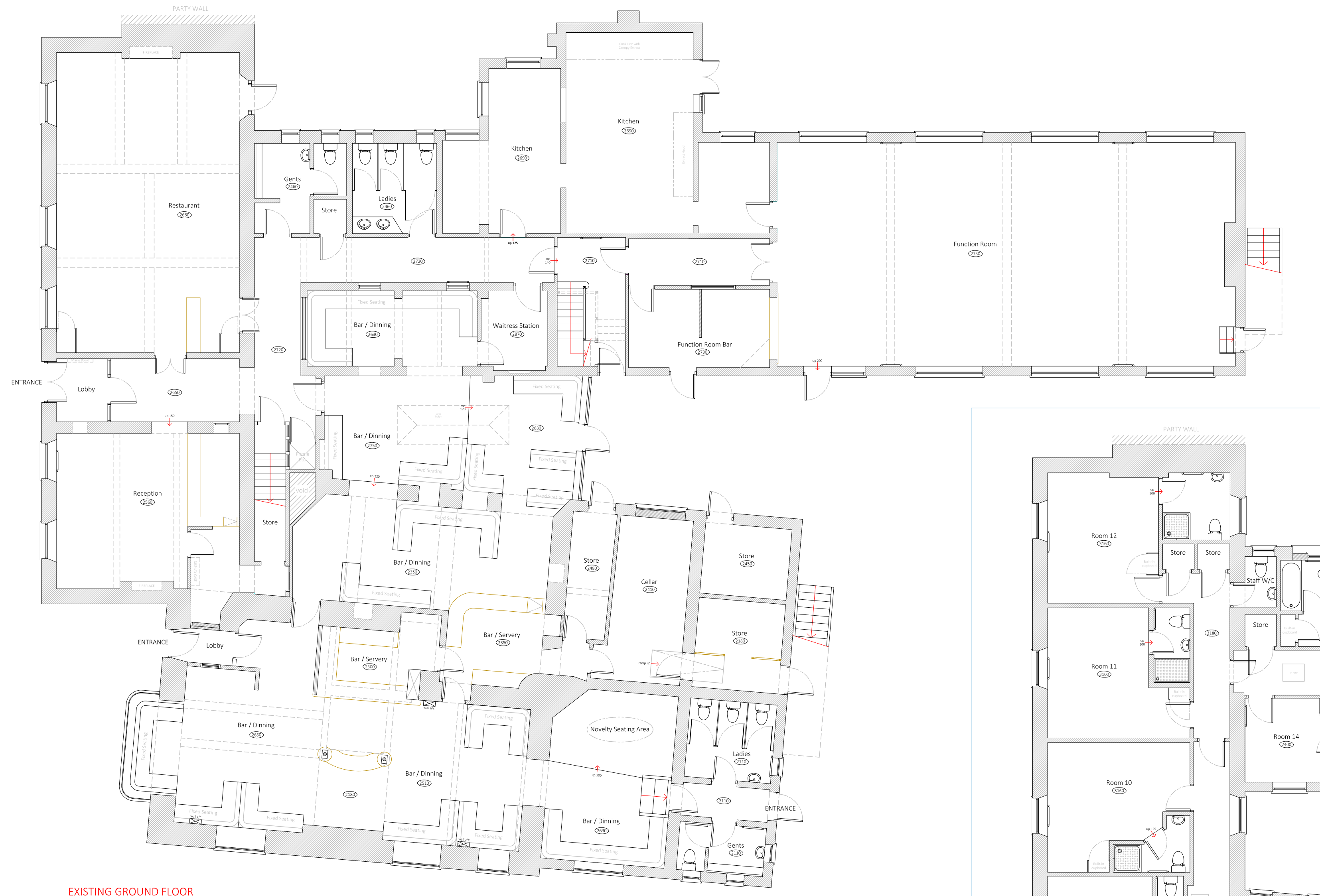
EXISTING GROUND FLOOR