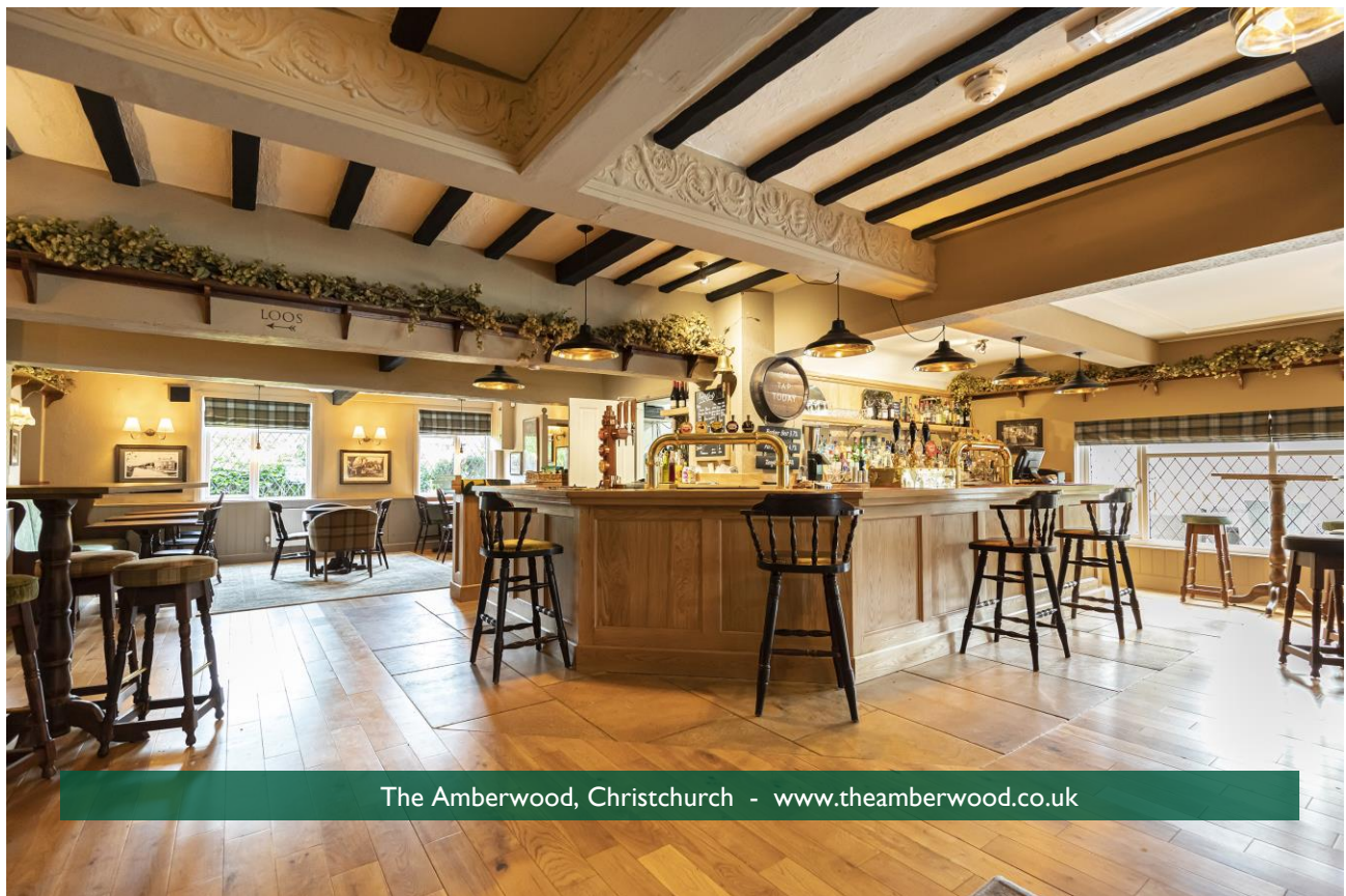
The Amberwood, Christchurch - www.theamberwood.co.uk

From start to finish, the recruitment process will generally take between three and four months. However, these timescales are very much driven by our ability to match you to a pub where we believe you have the opportunity to succeed and also by the time it takes for you to produce your Business Plan.