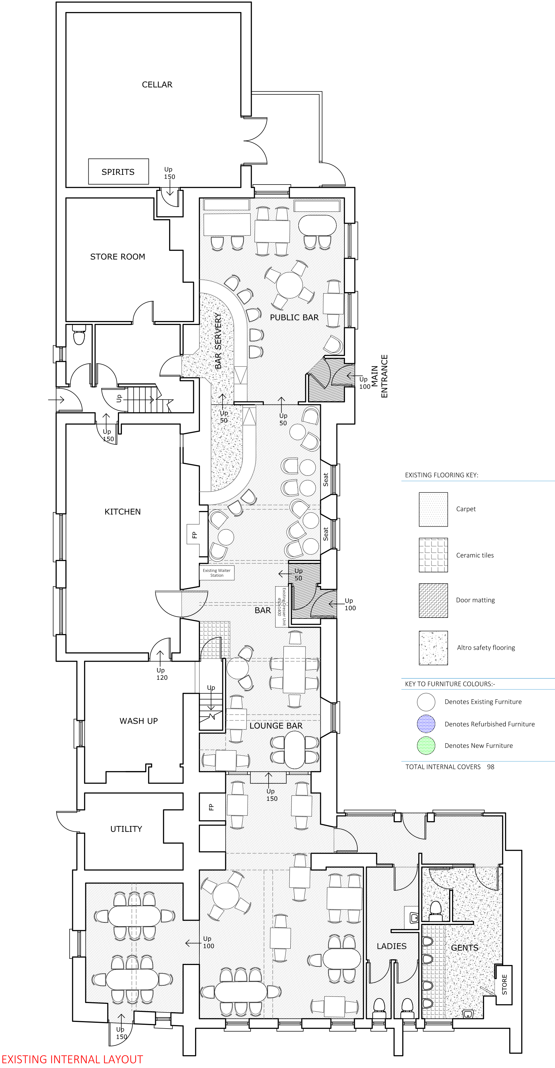
EXISTING INTERNAL LAYOUT